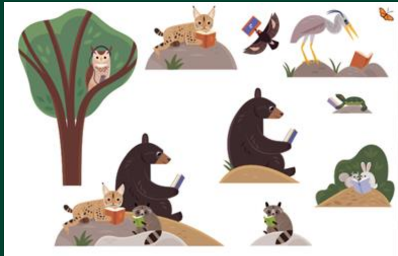
Draft Sticker Sheet

Gift Card: Entry to drawing regardless of level of participation